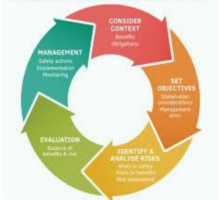
Figure 1.2a Duty holder responsibilities under civil law: the tree risk management process.